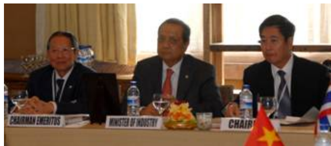
H.E. Mohamad S. Hidayat (middle) opens AFTEX Council Meeting in Bali

The textile & apparel sector is best positioned to lead ASEAN's priority sectors towards regional integration according to Indonesia's Minister of Industry H.E. Mohamad S. Hidayat, who officially opened the AFTEX Council Meeting in Bali on January 14.